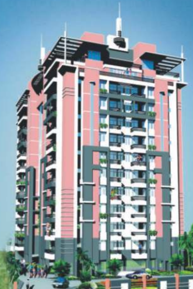
Eldeco Empereur New Hyderabad, Lucknow