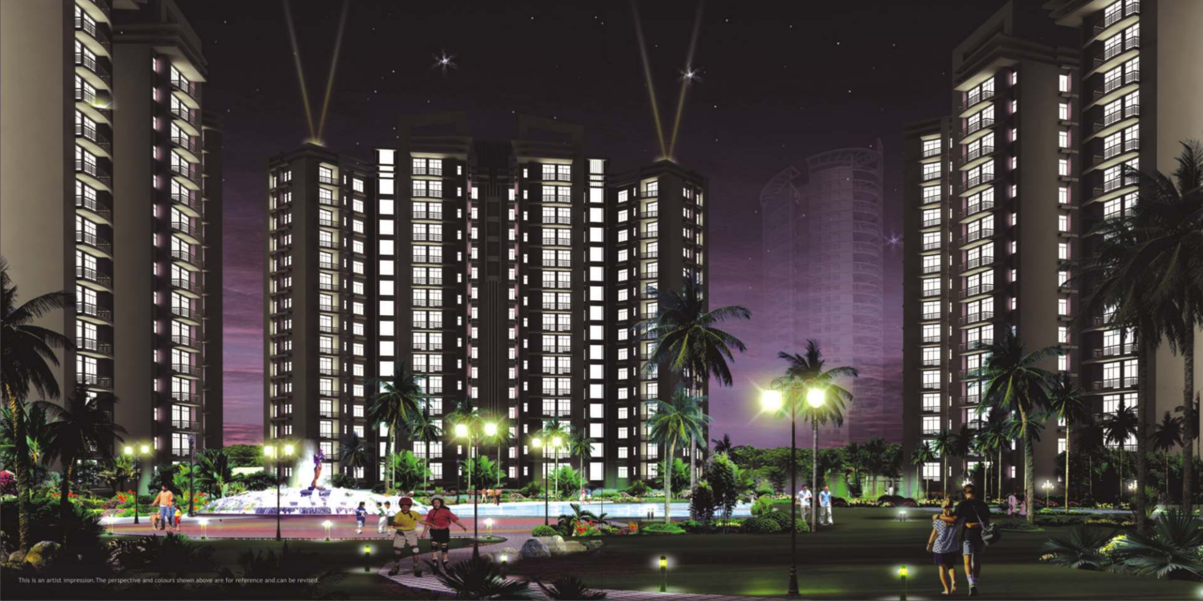
This is an artist impression. The perspective and colours shown above are for reference and can be revised.