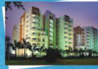
Eldeco Park View Adj. Aliganj, Sitapur Road, Lucknow