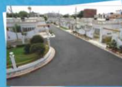
Eldeco Harmony Enclave Udyan-I, Jail Road, Lucknow