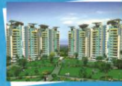
Eldeco Elegance Vibhuti Khand, Gomti Nagar, Lucknow