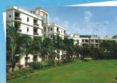
Eldeco Greens Gomti Nagar, Lucknow